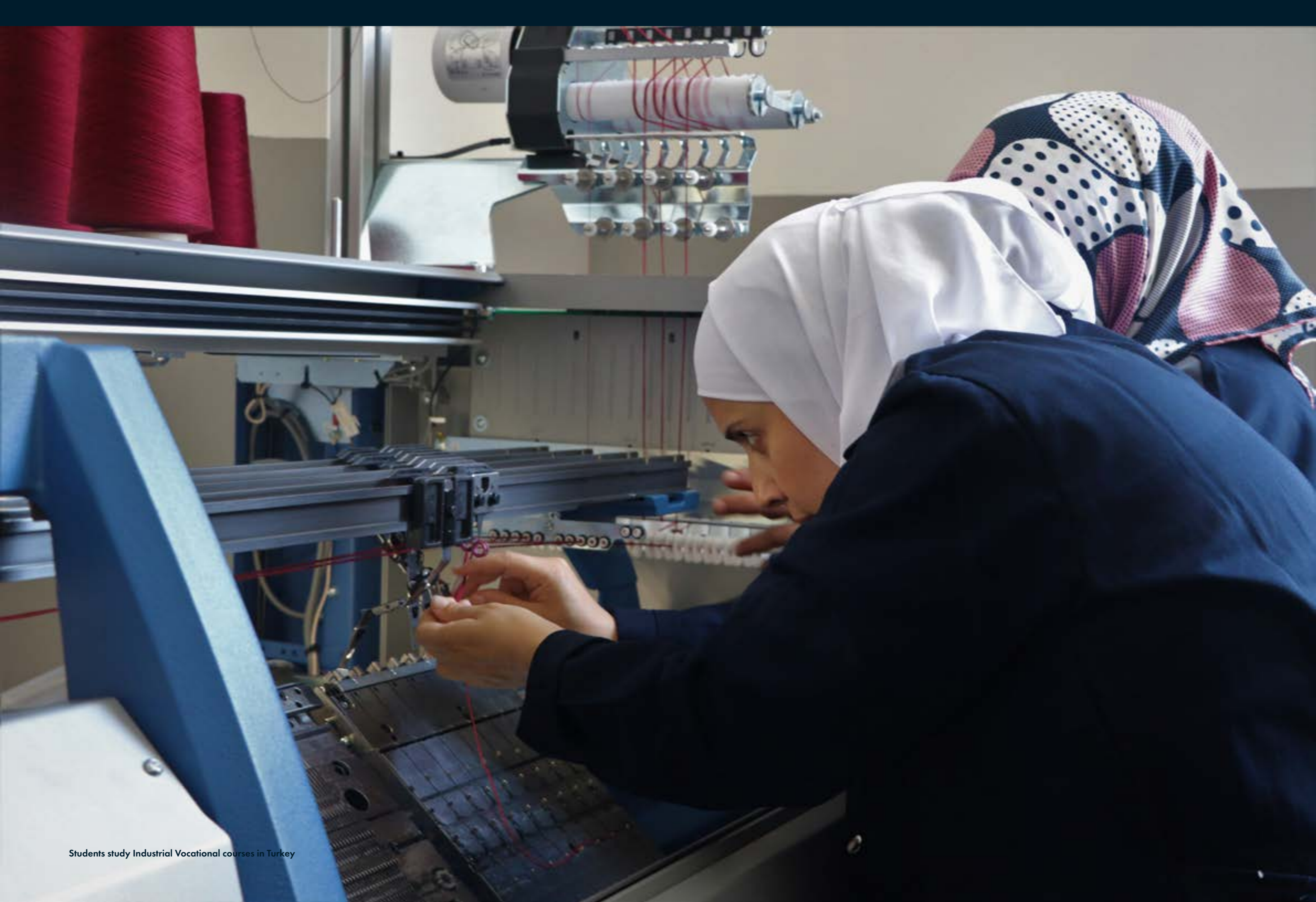
Students study Industrial Vocational courses in Turkey