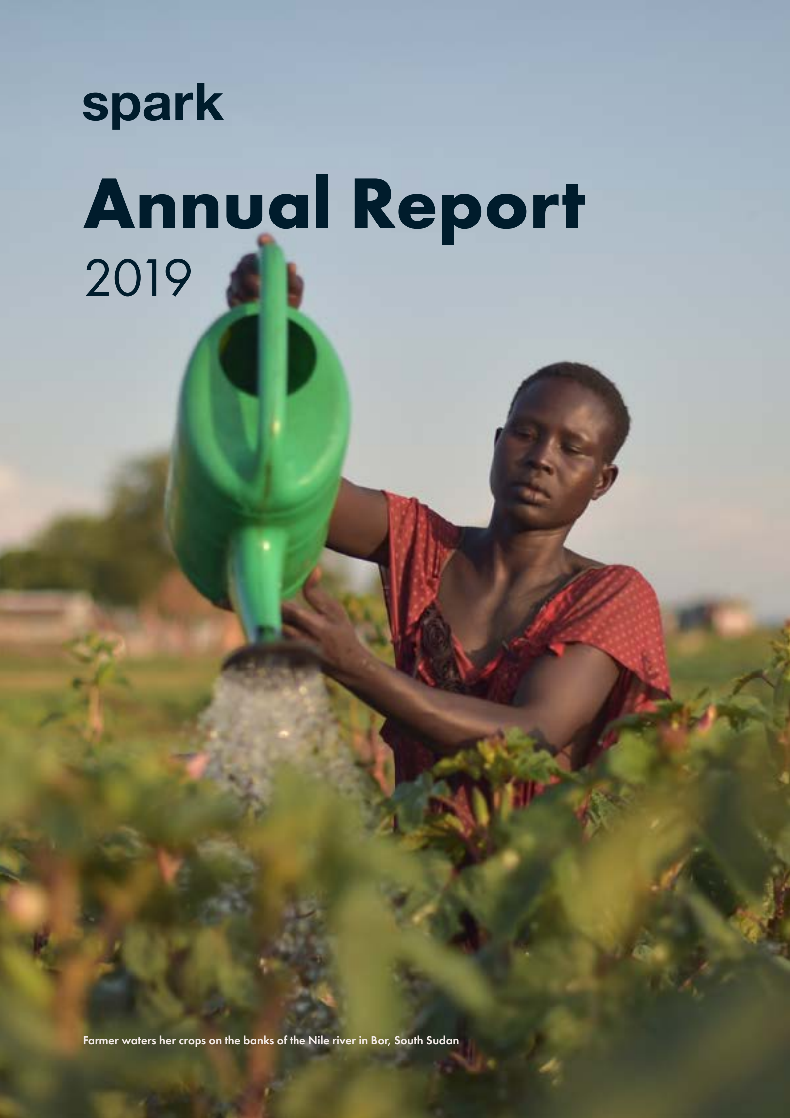
Farmer waters her crops on the banks of the Nile river in Bor, South Sudan